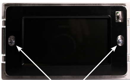
Wall fixing holes behind face plate