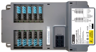
LCMD-10 DALI LCM

iLight offer a full range of wiring accessories to compliment the Solo LCC-10 Lighting Connection Centre for stand alone applications and for the LCMD-10 DALI LCM for networked applications. A selection of sensors, plugs, t-pieces and extension leads can be combined together to deliver a complete lighting solution from one source.