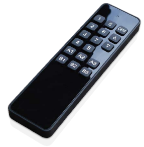
Remote Controller - HH171R (Order Separately)

Fixing: 2 x Spring Clip Mounting Hole Diameter: 40 to 45mm Diameter depending on ceiling material Weight: 35g Temperature: 0 to 45°C (Non Condensing) Supply: 12 - 24V dc (Regulated) Construction: Circular Plastic Housing UL94 V0 rated Load data: 8m A @ 15V Max recommended mounting height: 3.4m