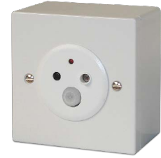
Surface mounting box - AX-SMA1 (Order Separately)