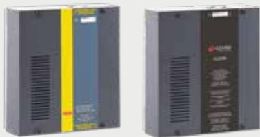
SCD24 & SCD96