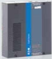
SCD24 & SCD96