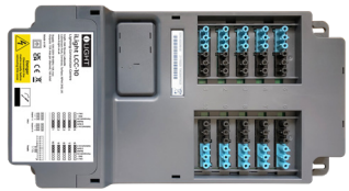
LCC-10 Lighting Connection Centre