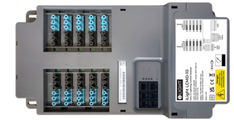
LCMD-10 DALI LCM

iLight offer a full range of wiring accessories to compliment the Solo LCC-10 Lighting Connection Centre for stand alone applications and for the LCMD-10 DALI LCM for networked applications. A selection of sensors, plugs, t-pieces and extension leads can be combined together to deliver a complete lighting solution from one source.